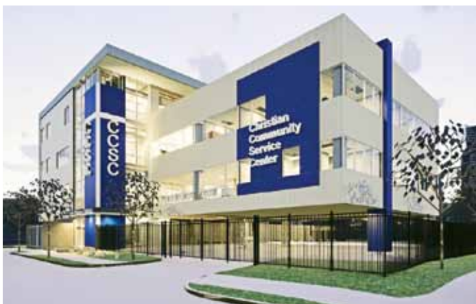
Artist's rendering of the new J. Dean Robinson Building slated for completion in late 2020 or early 2021.

The new 4-story J. Dean Robinson Building, designed by Studio Red Architects and constructed by Arch-Con Corporation with Forney Construction as the Project Manager, will take the place of the two original structures on CCSC's main campus on Branard Street. The new building will house Emergency Services-Central, JobNet, and the administrative offices all in one location, making it more convenient for clients needing multiple services.