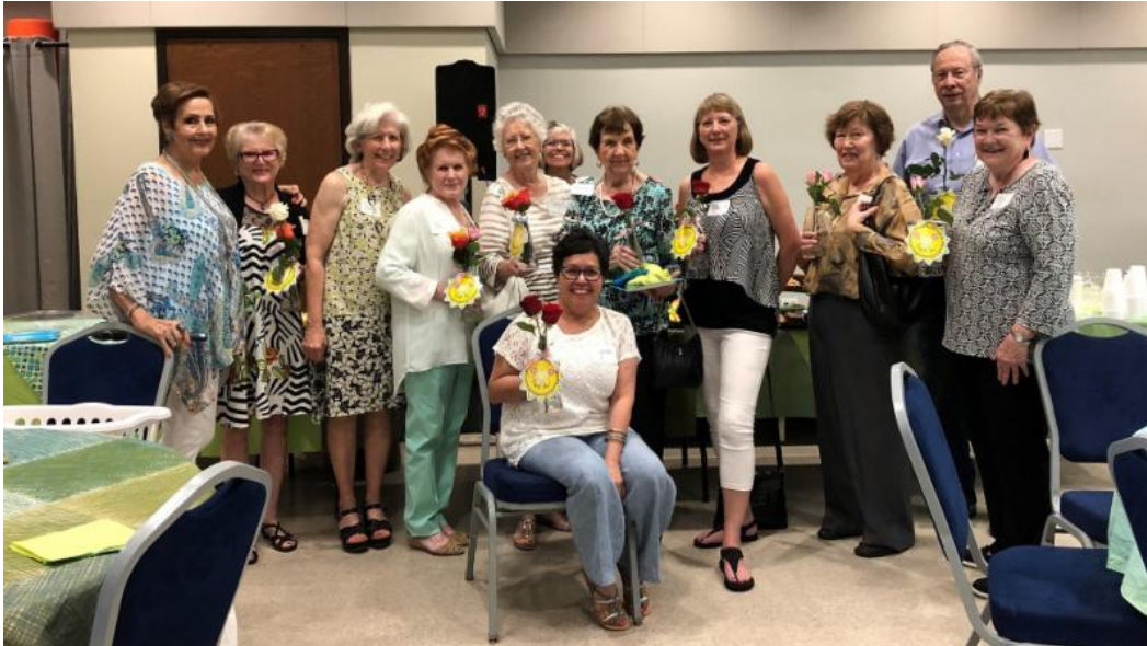
Some of the many volunteers who came by to celebrate each other and the mission of Christian Community Service Center's Sunshine Resale Shop.