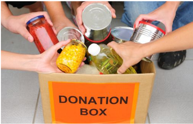
Food drives and donations help CCSC to help others.

Christian Community Service Center's Emergency Services programs serve individuals and families from all walks of life. Only through the consistent and generous support of our community is CCSC able to provide food, clothing, and financial assistance to our neighbors in need.