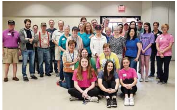
Photo: Food Fair volunteers

Emergency Services-Southwest is hoping to host six Food Fairs in 2019—the most recent was held on Saturday, March 30. This service is open to the public and features free produce, dairy items and other nutritious groceries. These items, provided through CCSC's partnership with the Houston Food Bank, have become a valued addition to regular pantry operations. On March 30, 43 volunteers distributed 10,267 pounds of food to 188 families. We thank the volunteers from Bering Drive Church of Christ, CCSC, National Charity League, Rice Temple Baptist Church and St. Luke's United Methodist Church for serving our community at the Food Fair.