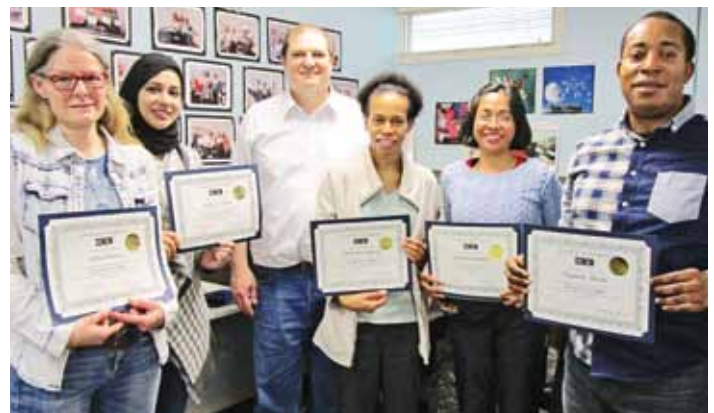
JobNet graduates show off their certificates upon completion of a computer class.

There are many times when community members may need extra help. CCSC is there to lend a hand to those experiencing challenges. If you know someone in need of help, please direct them to CCSC's door. If you would like to join our team and help us to help others, please contact CCSC to learn more about how you can make a difference.