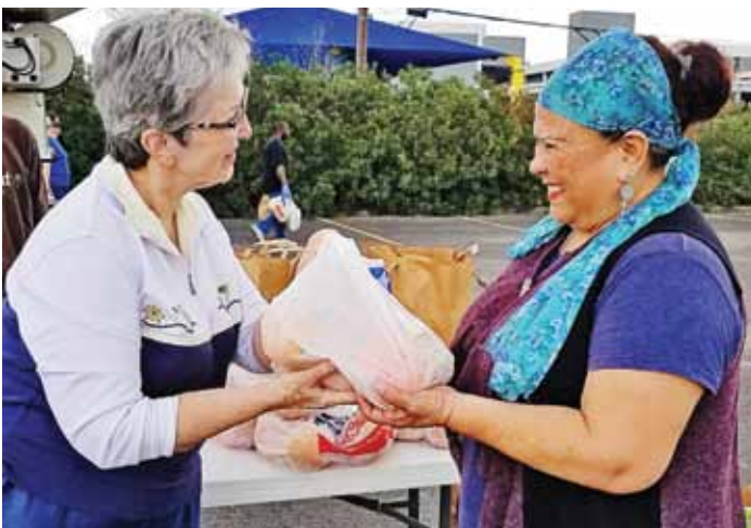
CCSC and the Houston Food Bank partner to hold a Food Fair for the community.

Over the years, we have discovered that there are some myths about the people helped at CCSC. We would like to shed light on some truths regarding our clients in hope that these truths will inform and further inspire supporters of CCSC's vibrant ministry.